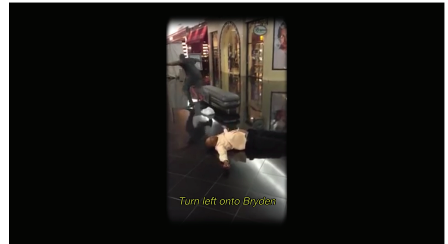
Cameron A. Granger Still from This Must Be the Place , 2018 Color video, with sound, 4 minutes, 30 seconds