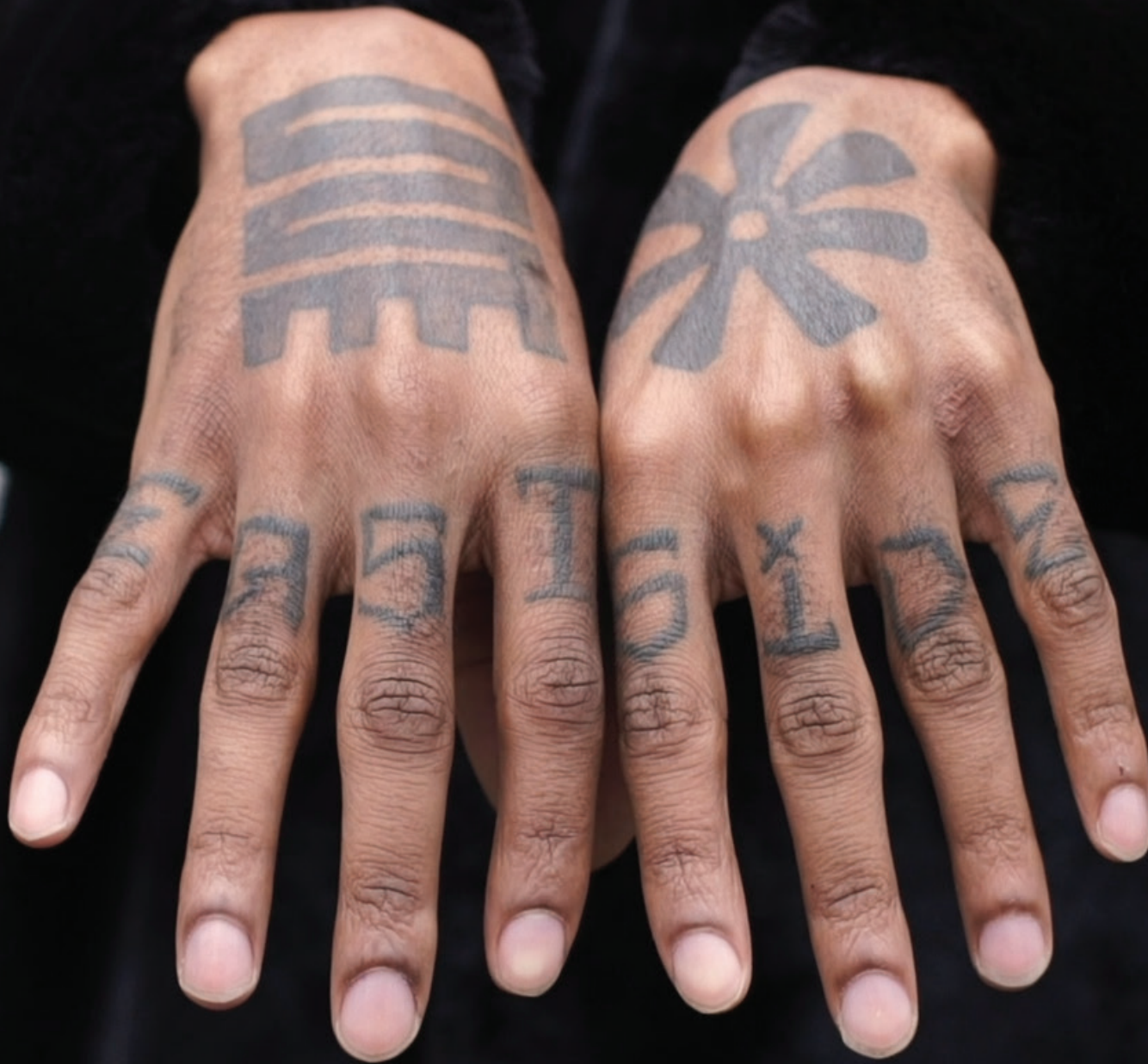
Cameron A. Granger Still from The Line , 2021 Color video, with sound, 7 minutes