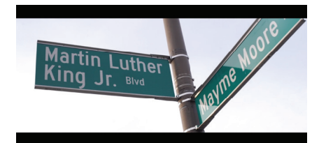
Cameron A. Granger, still from The Line , 2021. Color video, with sound. 7 min.

These perspective shifts also engage a conversation between the local and national in Granger's constructed map. While The Line is undeniably about the Ohio places that raised Granger, he works to universalize this experience by highlighting how the spaces of Black life and resilience often look similar. Granger uses audio from a Chris Rock sketch to demonstrate preconceived notions that Black neighborhoods are violent and MLK Jr. Blvds act as their lines of demarcation. He then includes an image of a Black man in a gold shirt that he begins to rotate. This gold contrasts the violence Rock cites, as well as the Wiz's proclamation that red is now the color of regality, a color often associated with gang culture. The scene transitions, now displaying the intersection of MLK Jr. Blvd and Mayme Moore Place in Columbus, a street corner that houses Mayme Moore Park, where many Black community gatherings occur in the city.